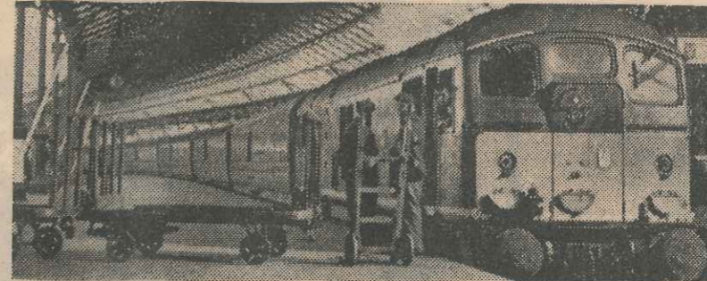
THE RAIDED MAIL TRAIN REACHES EUSTON